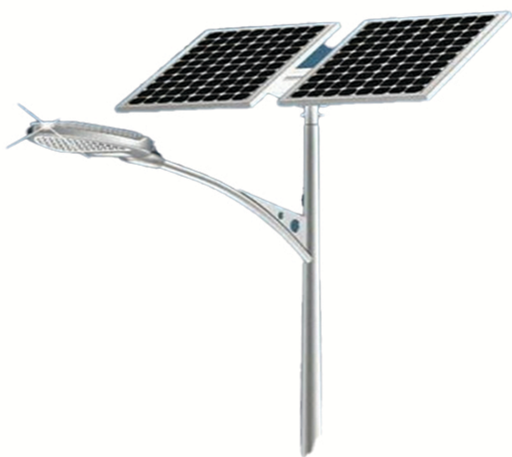
Solar Street Lights