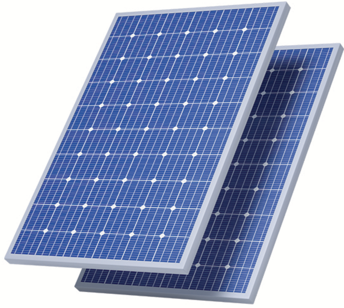
Solar Roof Top