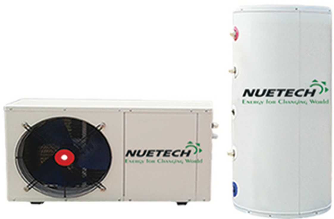
Solar Integrated Heat Pumps